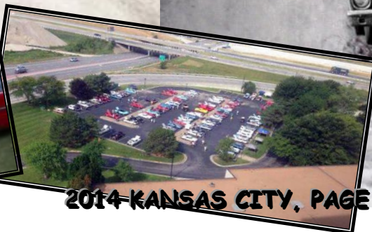
2014 KANSAS CITY, PAGE 11