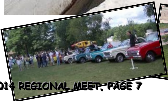
2014 REGIONAL MEET, PAGE 7