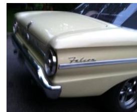
Rick's Car All Fixed!