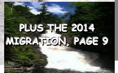
PLUS THE 2014 MIGRATION, PAGE 9