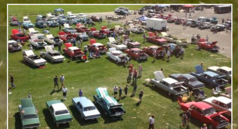
More Pictures of the 2015 Nationals See Page 9