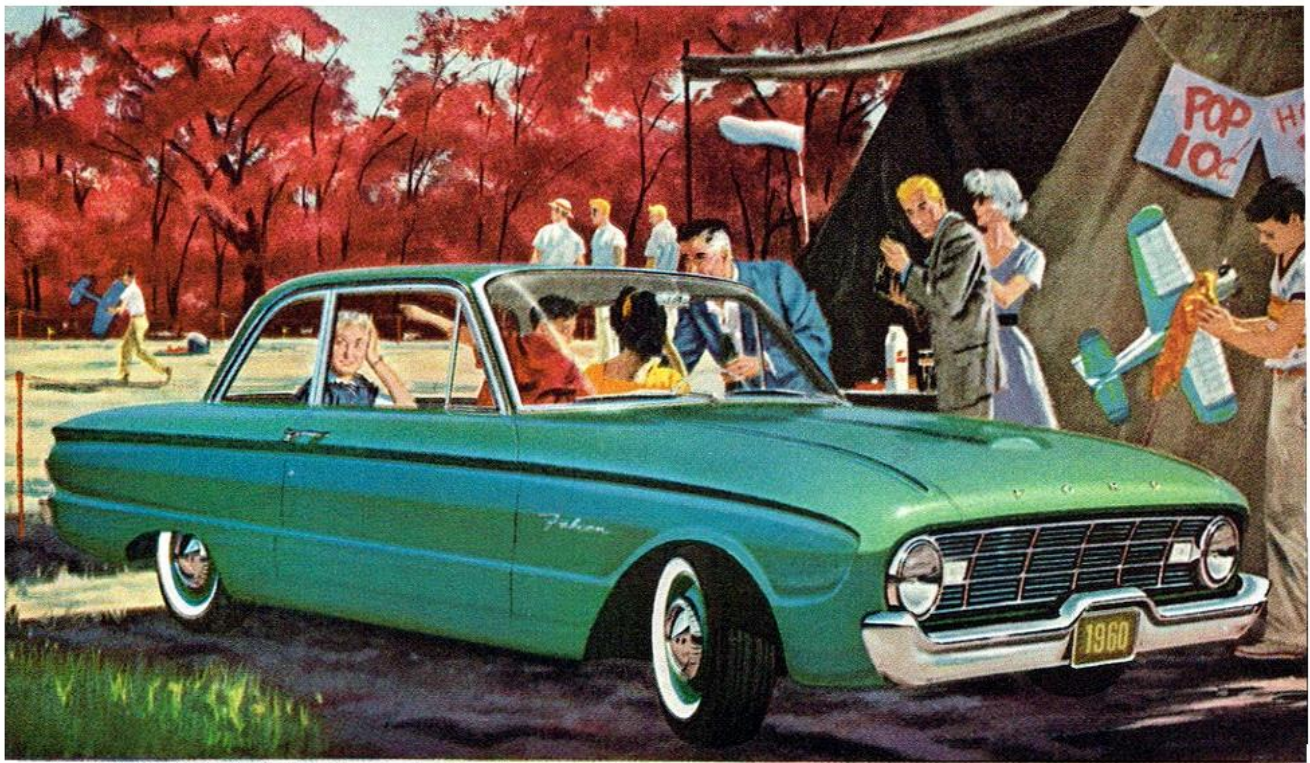
See "FORD STARTIME" in living color Tuesdays on NBC