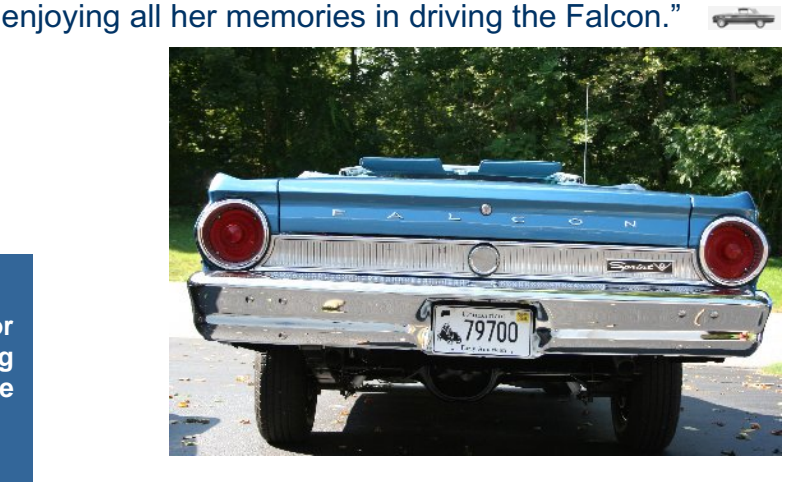
VOLUME 2. ISSUE 5. SEPT/OCT 2009