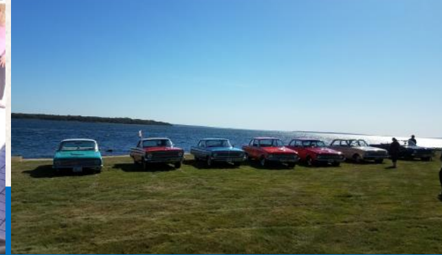
Chapter Meeting, October 21st