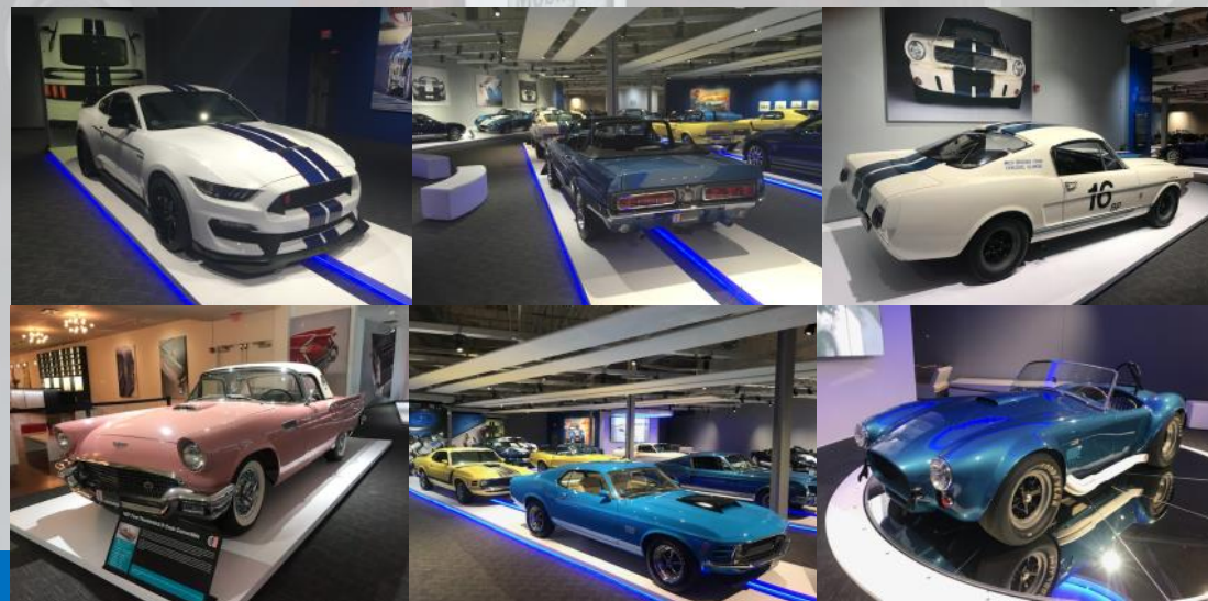
More from the Newport Car Museum