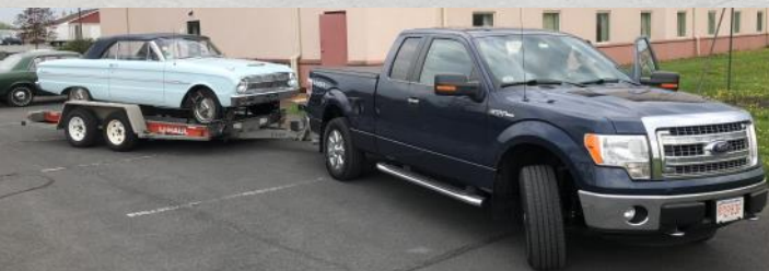
When the baby seat doesn't fit in the Falcon (1st time being trailered to a show in 24 years)