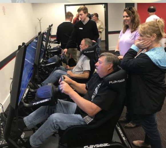
The gang all trying out the simulators on their favorite tracks