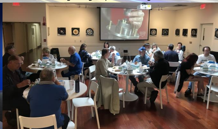
The gang enjoying lunch