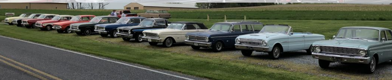
Friday Night Dinner Lineup