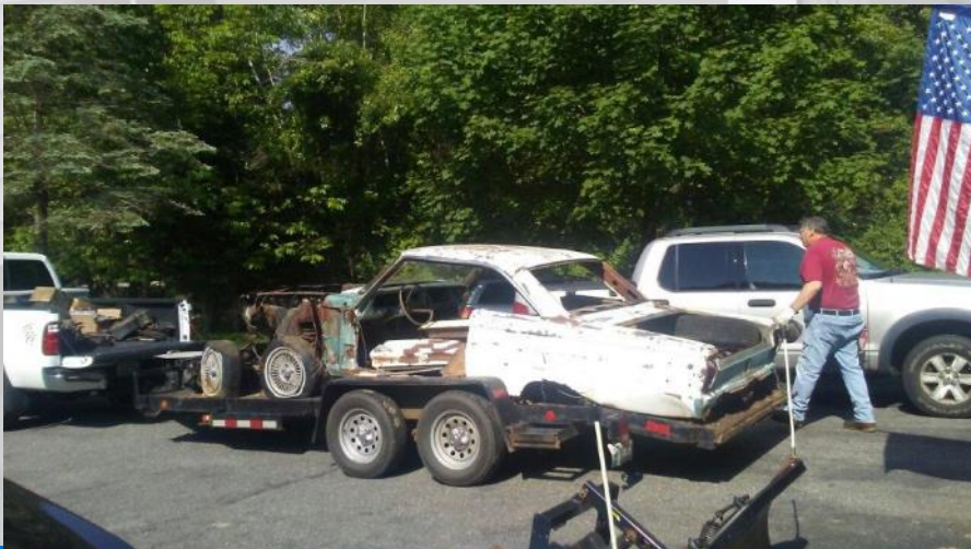
"Another One Bites the Dust"