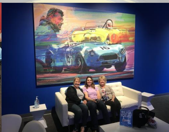
Enjoying the Artwork