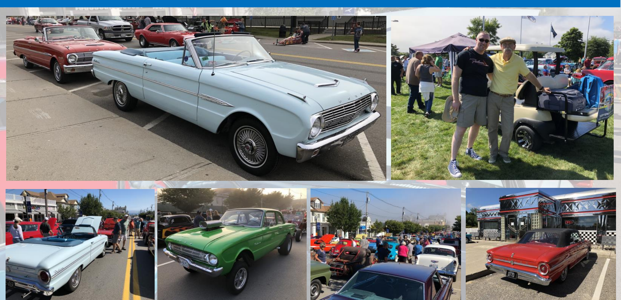
Junk Yard Falcons